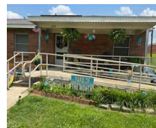
Park Hill Village West