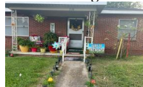
Park Hill Village East